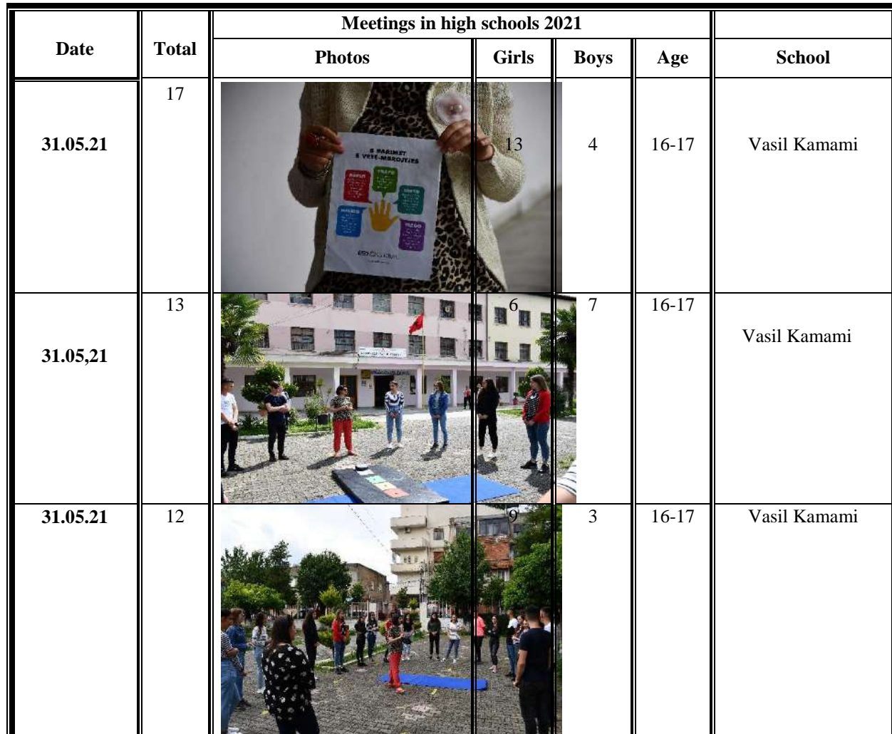
Table with the meetings organized in schools