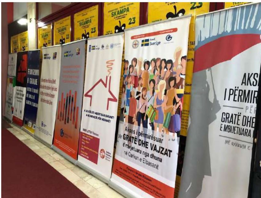
“SKAMPA” theatre hall