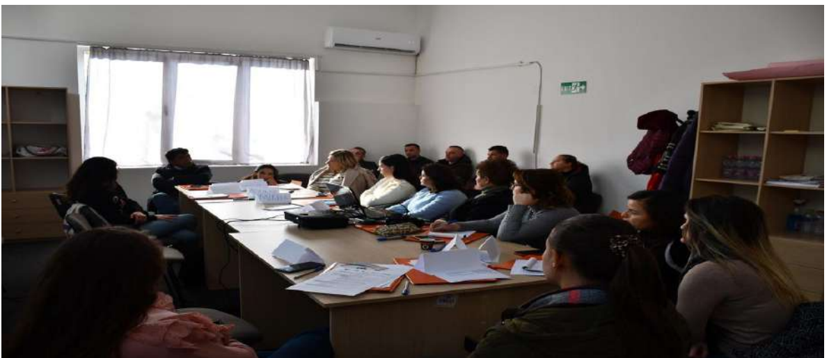
15.12.2021 Training of the Economic Assistance workers, Librazhd -Prenjas