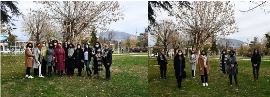
WFE staff during 2021

Since the first days of January, WFE started to build capacities among the new staff. Some of the topics covered were: