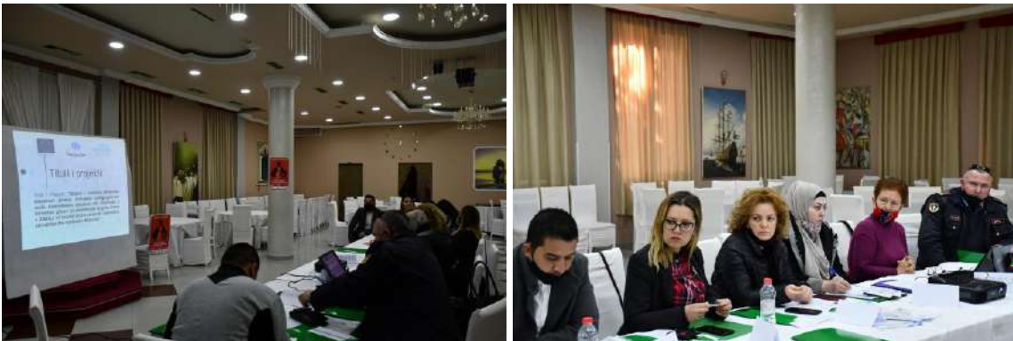
25.02.2021 Training of the Economic Assistance workers, Cërrrik