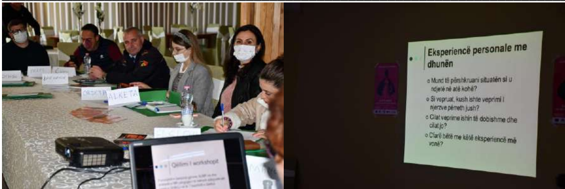
Workshop with the local professionals Belsh 24.02.2021