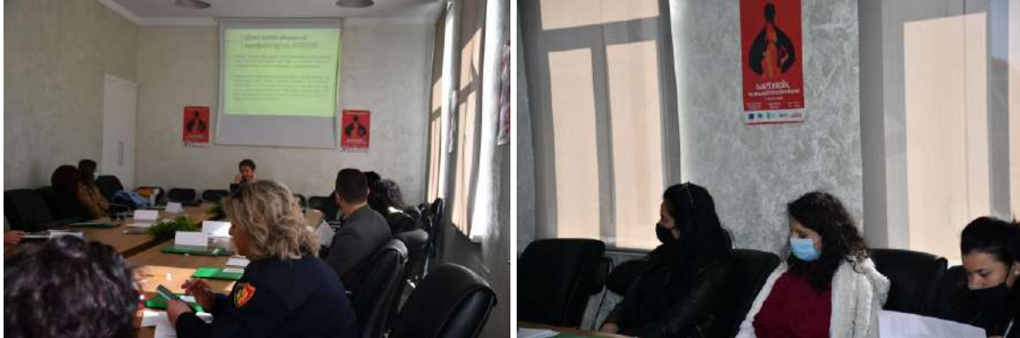
04.03.2021 Workshop Elbasan

Training with the workers of Economic Assistance Elbasan