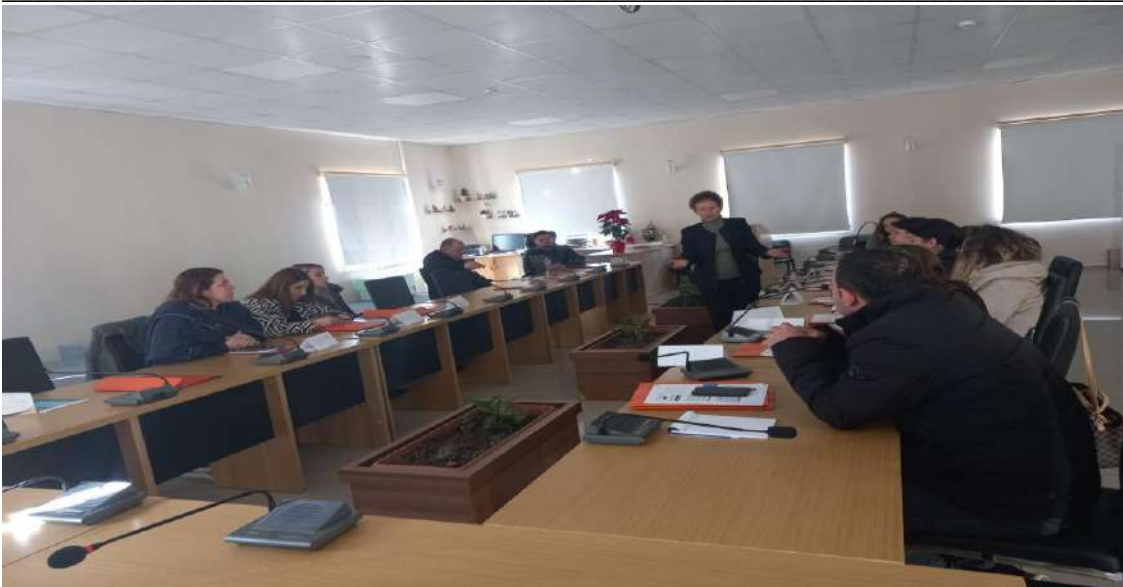
16.12.2021 Training of the Economic Assistance workers