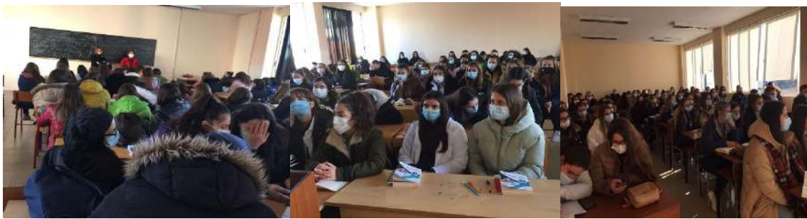
Meetings with students