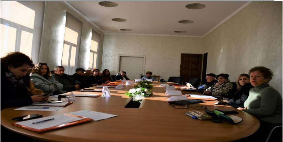
14.12.2021 Training of the Economic Assistance workers, Elbasan