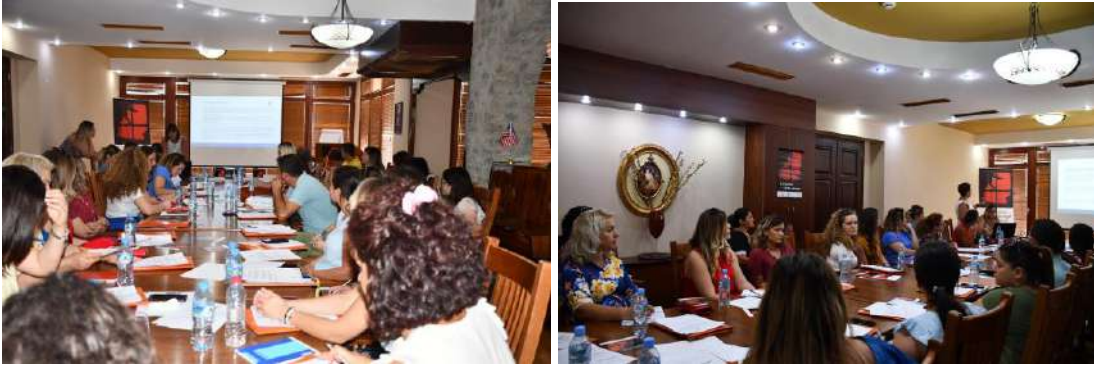
Photos from the Round Table July 30, 2021

Based on these findings, a monitoring report was prepared, which remained for 15 days on all WFE social media, and then this report was published.