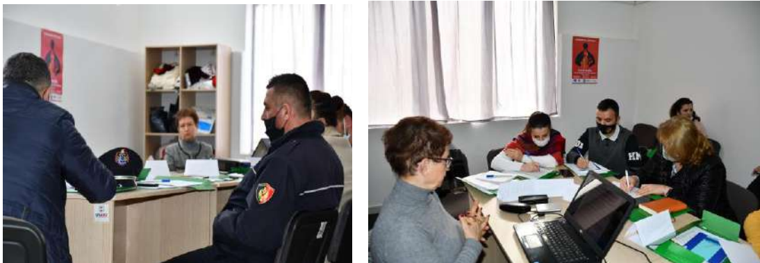
Workshop with the local professionals Librazhd 27.01.2021

Twitter: https://twitter.com/ForumiguasElba/status/1364648730016837635